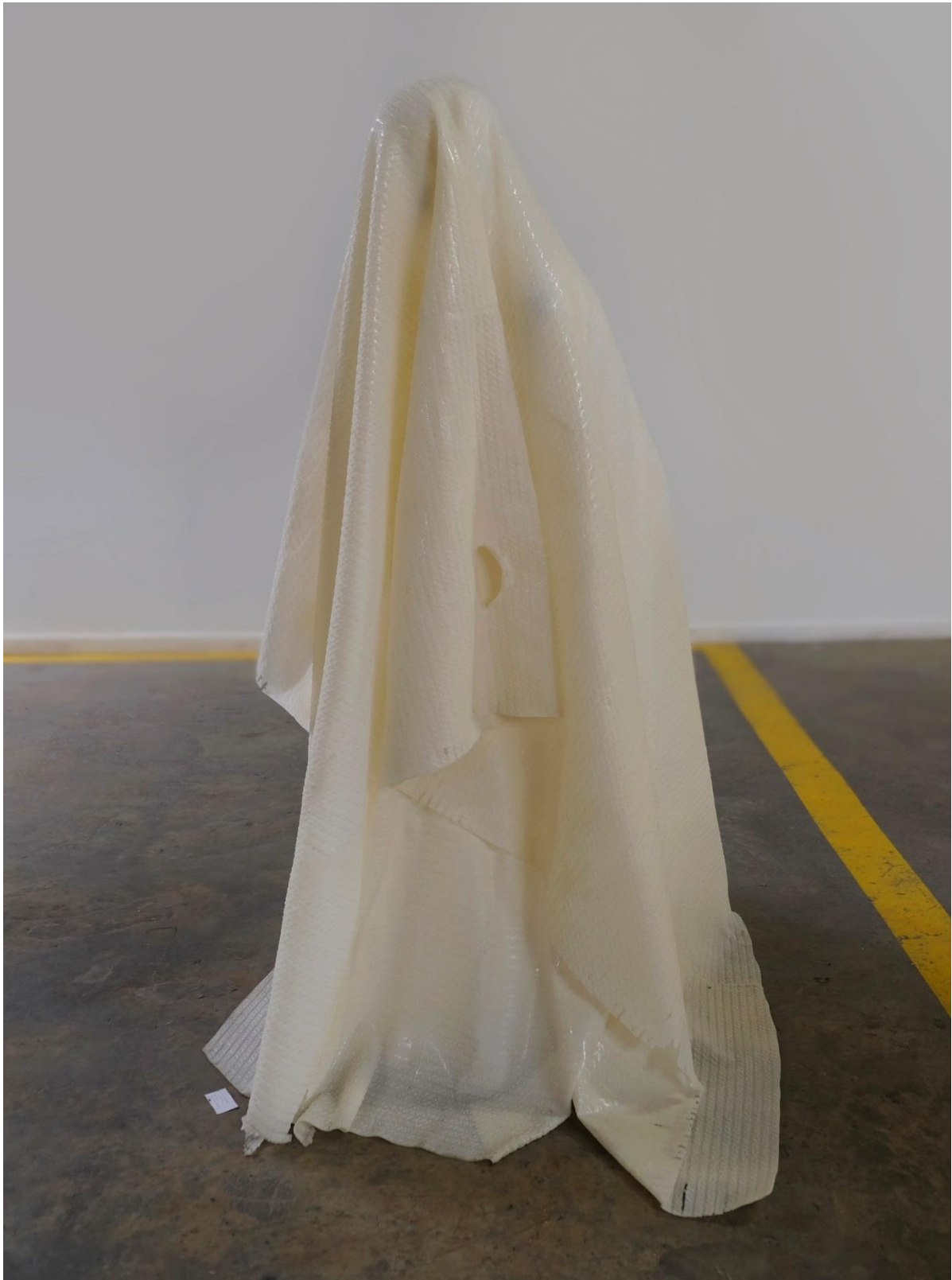
Baby Doe 1311 (2022). Wood glue, fiberglass, and supawood. 1300mm x 1200mm