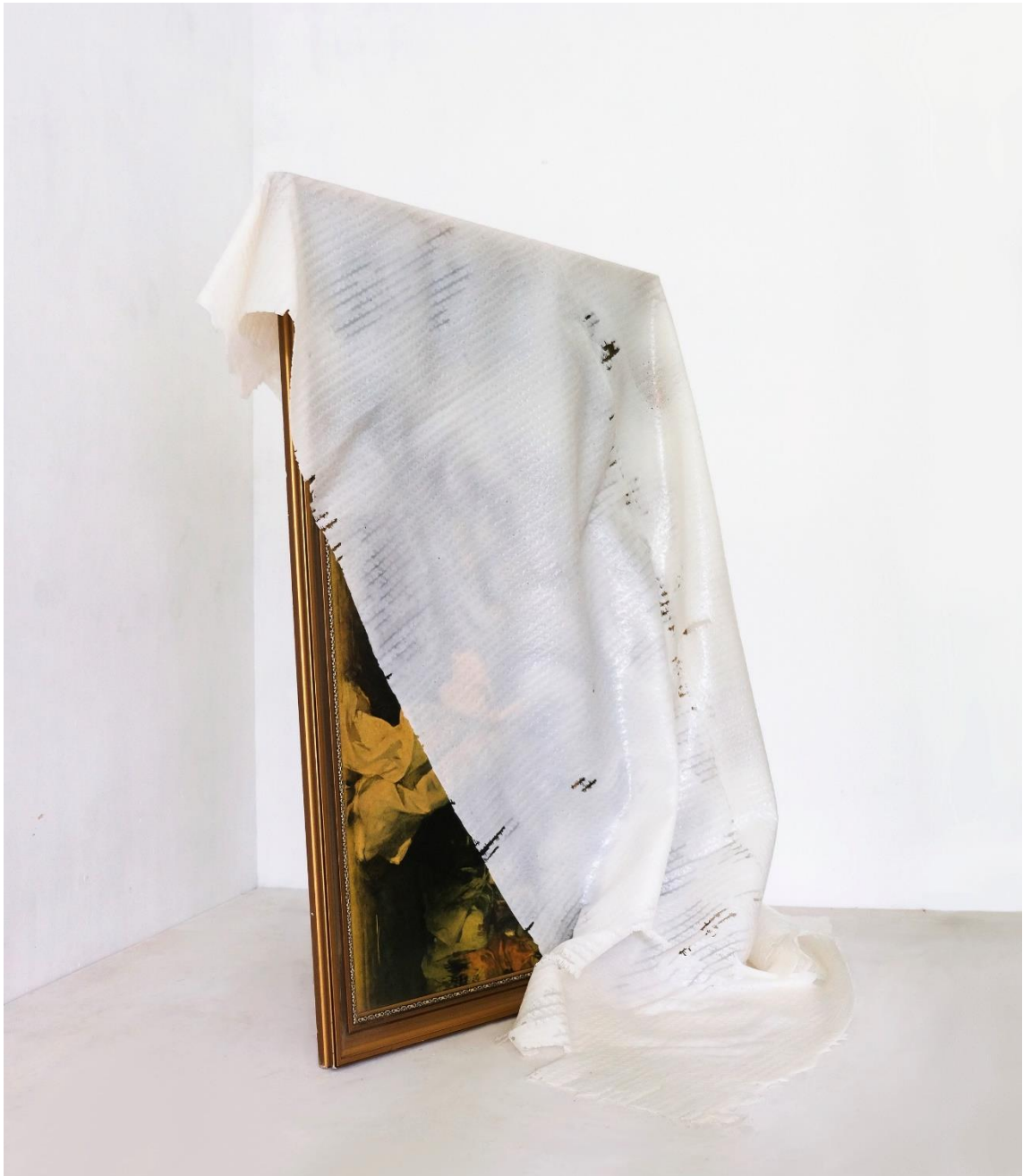
Untitled (No. 1 Embellishment) (2021). Wood glue and found object installation. 710mm x 490mm