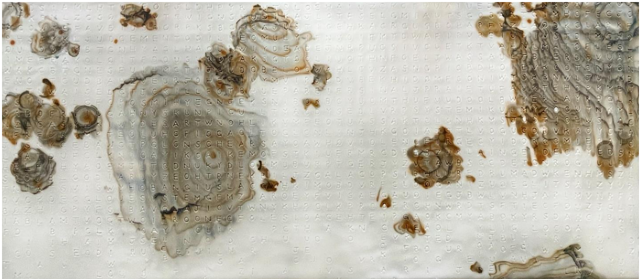
HEADLINER (2022). Wood glue and ink. 1023mm x 2045mm