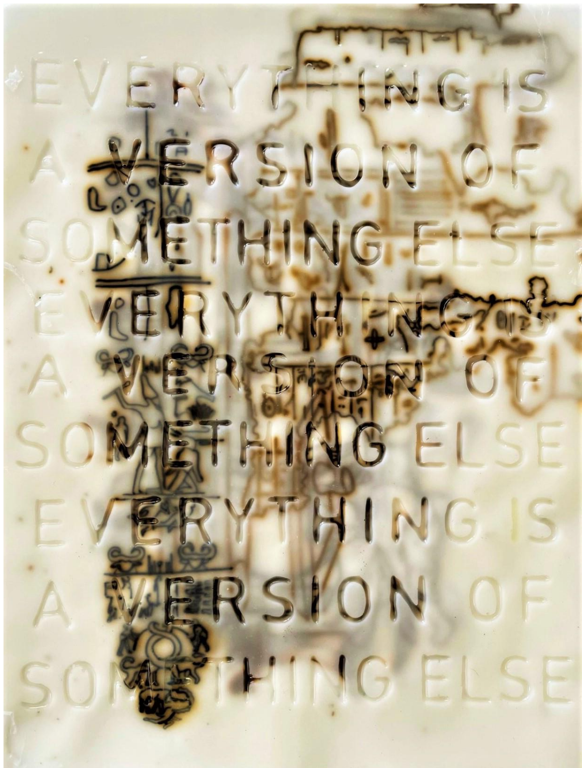
Fluid Mechanics: I (2021). Wood glue and ink. 340mm x 440mm