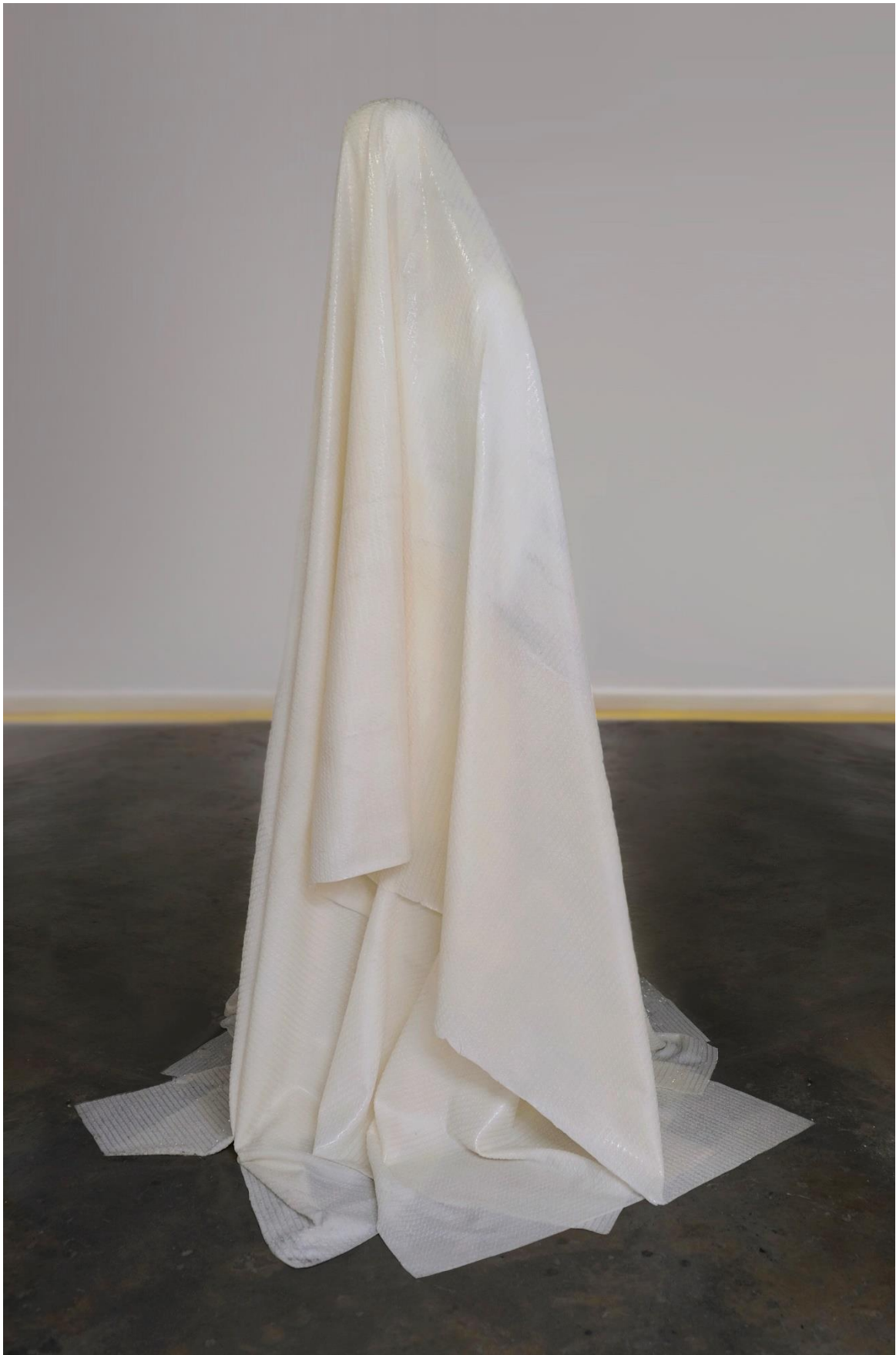
Doe 1014 (2022). Wood glue, fiberglass, and supawood. 1940mm x 1500mm