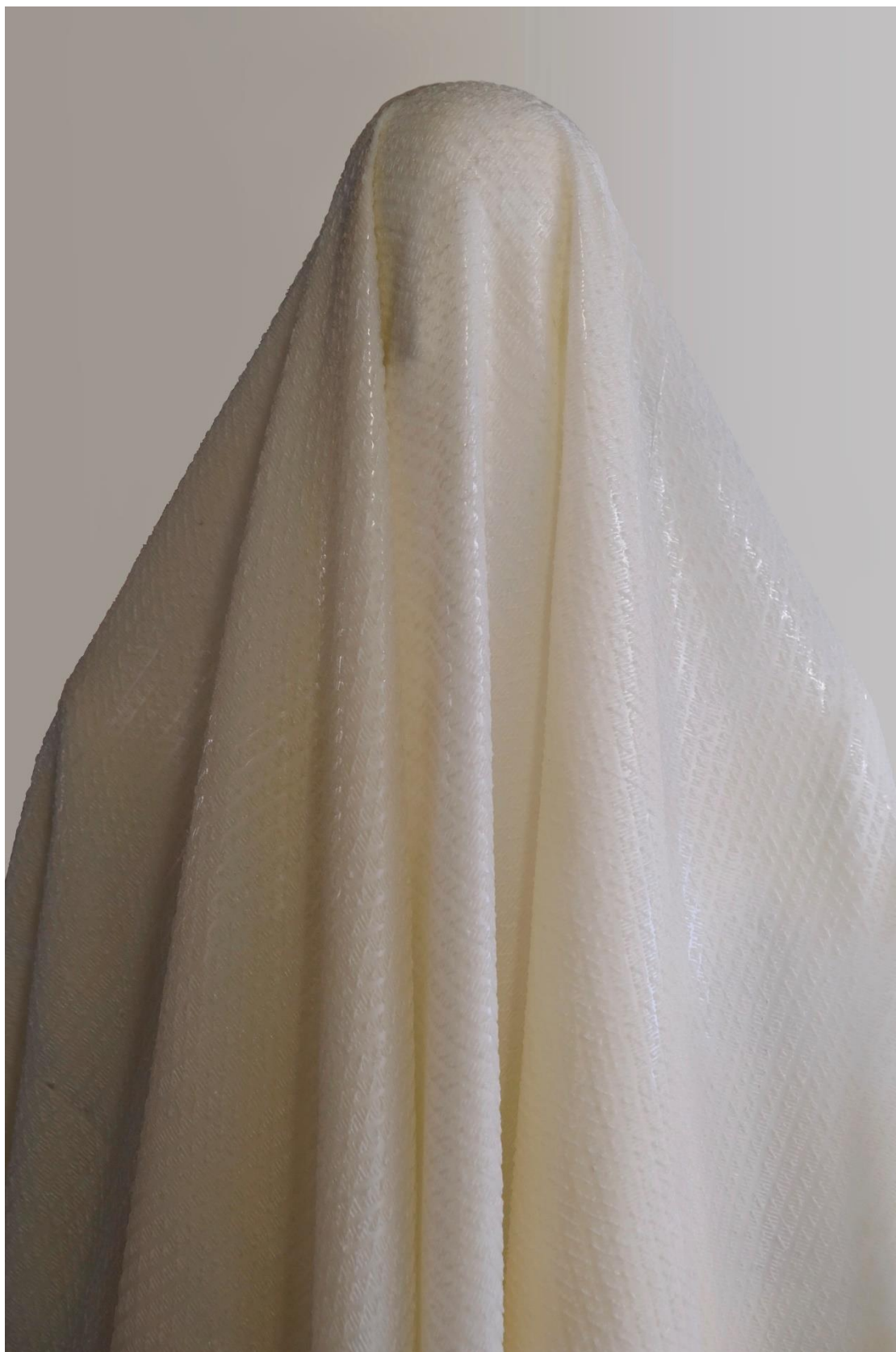
Doe 1014 (2022) Detail. Wood glue, fiberglass, and supawood. 1940mm x 1500mm