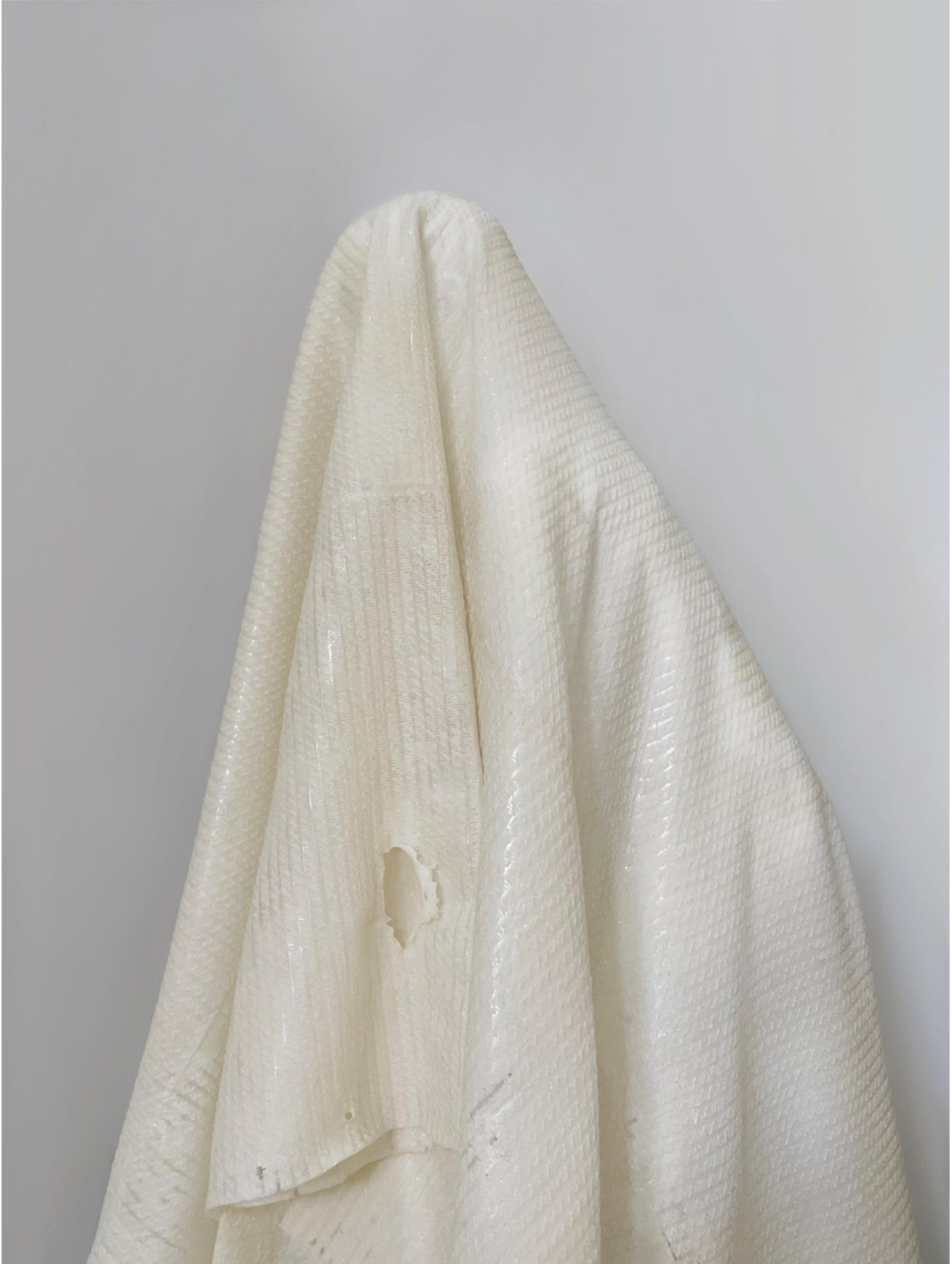
Baby Doe 1311 (2022) Detail. Wood glue, fiberglass, and supawood. 1300mm x 1200mm