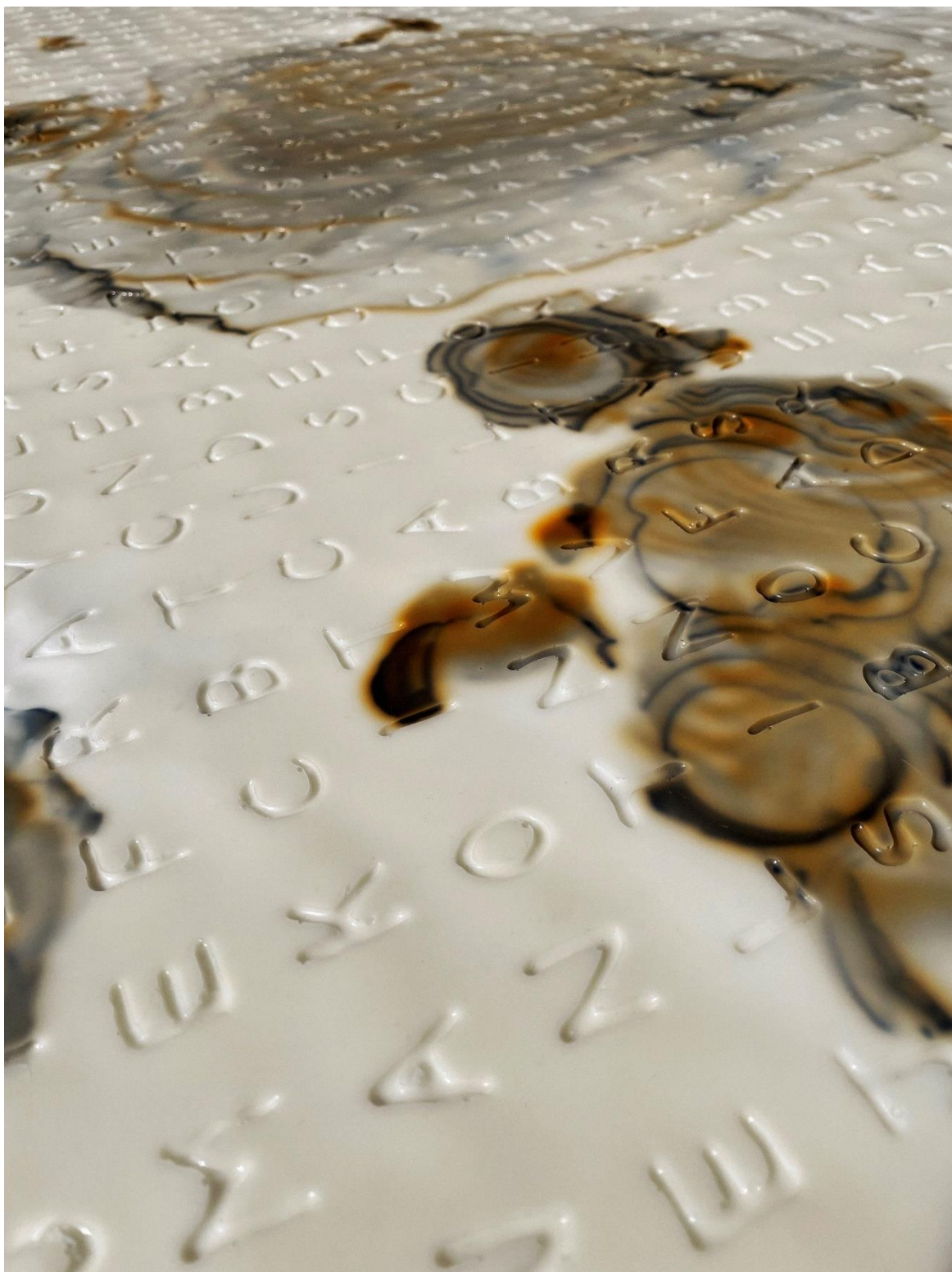
HEADLINER (2022) Detail. Wood glue and ink. 1023mm x 2045mm