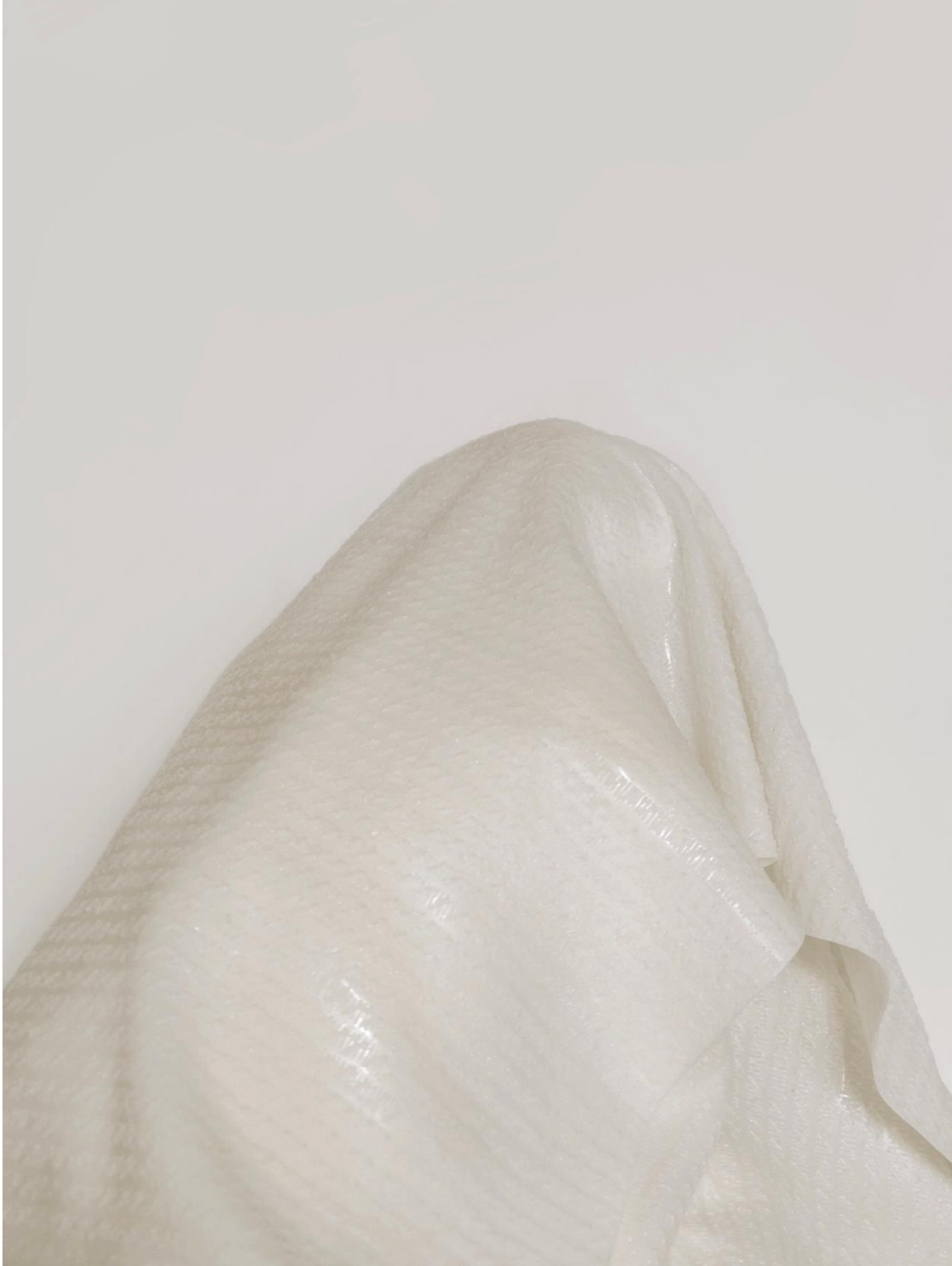
Baby Doe 208 (2022). Wood glue, sellotape, bubble wrap, and supawood. 502mm x 595mm