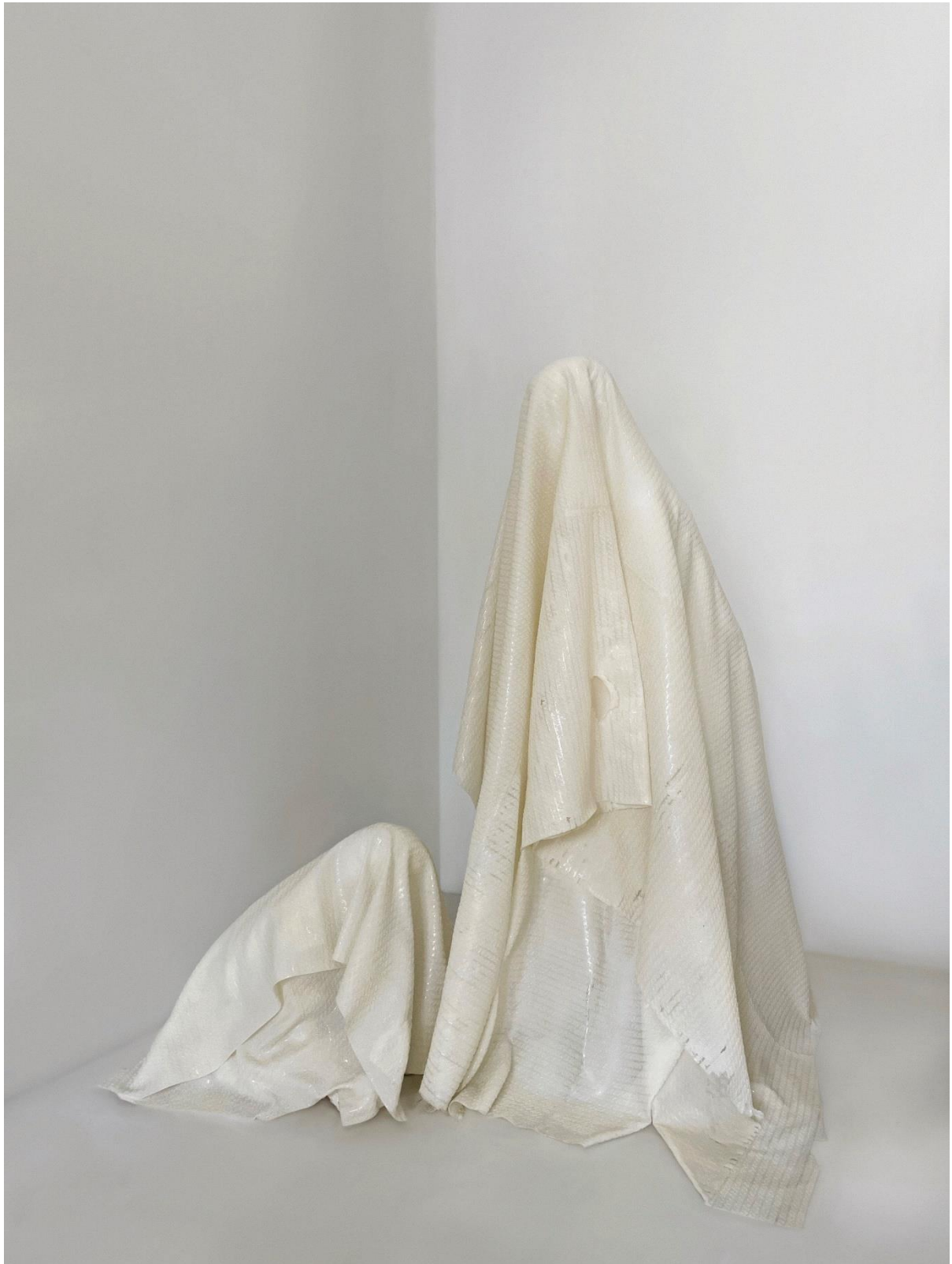
Baby Doe 208 & 1311 (2022). Wood glue, fiberglass, sellotape, bubble wrap, and supawood.