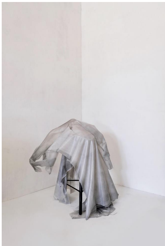
Creeping Replica (2019 - 2022). Screenshots of short video. Dimensions vary