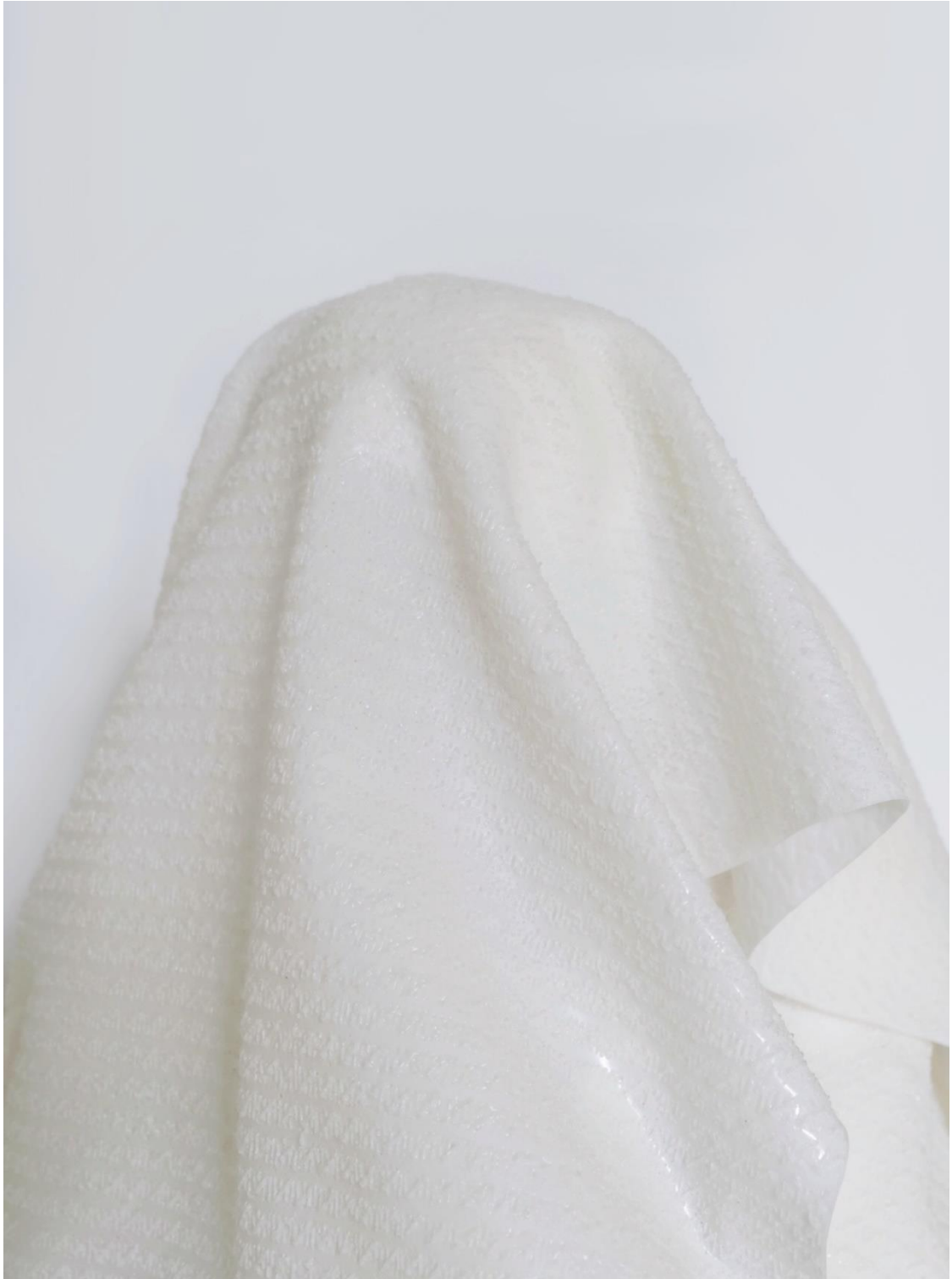
Baby Doe 208 (2022). Wood glue, sellotape, bubble wrap, and supawood. 502mm x 595mm