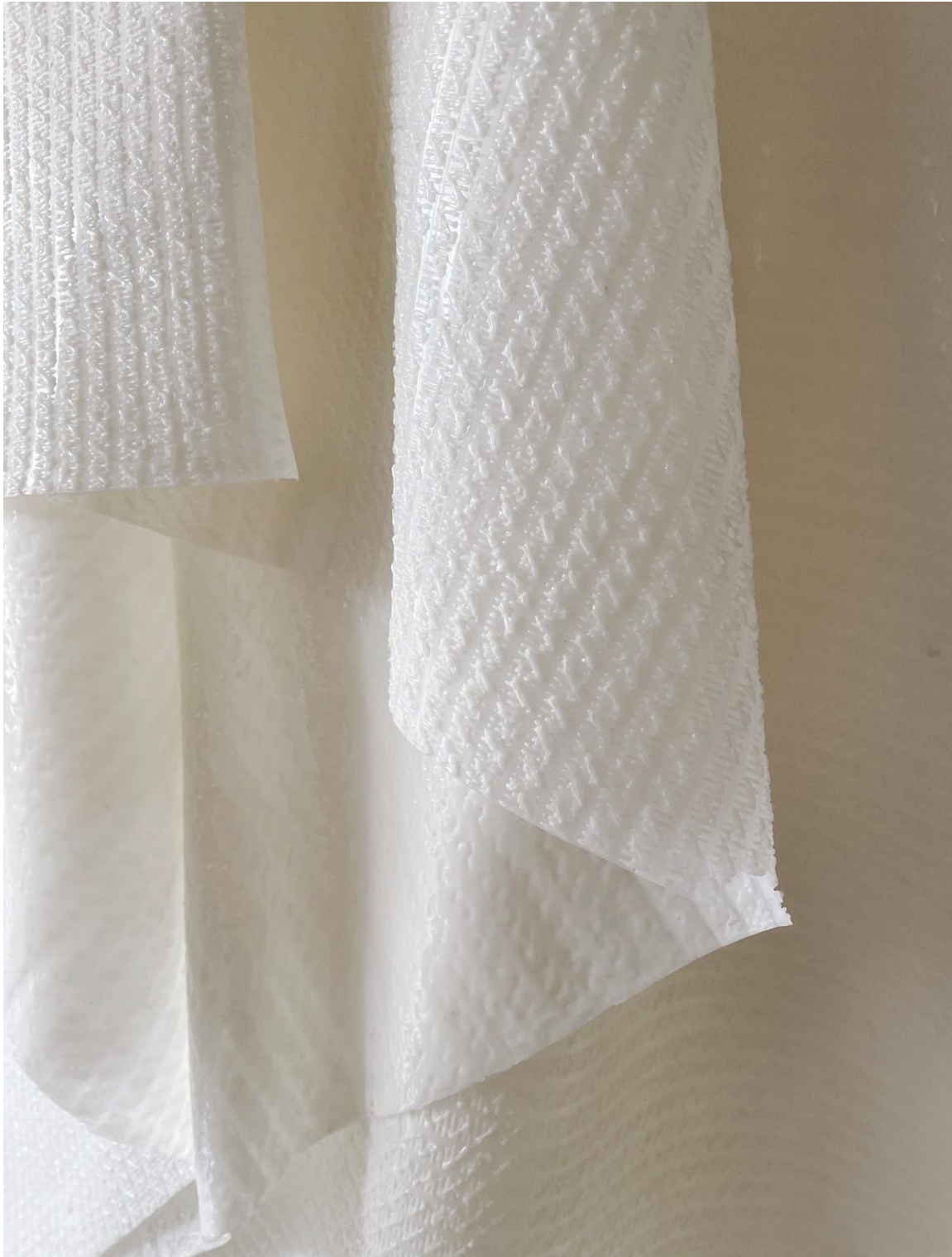
Baby Doe 1311 (2022) Detail. Wood glue, fiberglass, and supawood. 1300mm x 1200mm